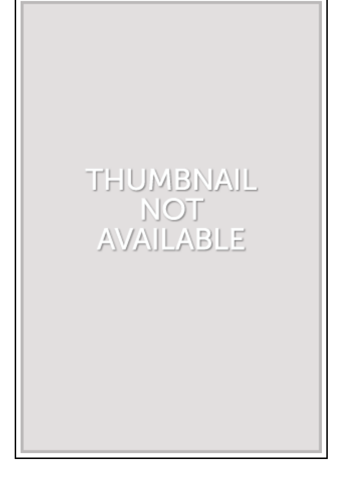
Filesize: 2.7 MB